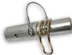
Drive adaptor - joins heads to aluminium rods