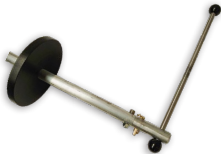
Drive handle for aluminium rod kits is adjustable and slides for use in confined spaces