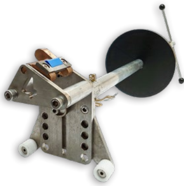
Tool set up (No.4 head single aluminium rod shown)